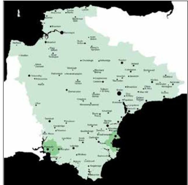
One Devon : 1/1/9 proposal

March to November 2025 – The Officers at SHDC and DCC are working very hard to model the income and service delivery costs for the two preferred models by DCC and SHDC (1/4/5 and 1/1/9) so that they can finally advise the Elected Members what the actual implications (finance and service levels possible) are for each model.